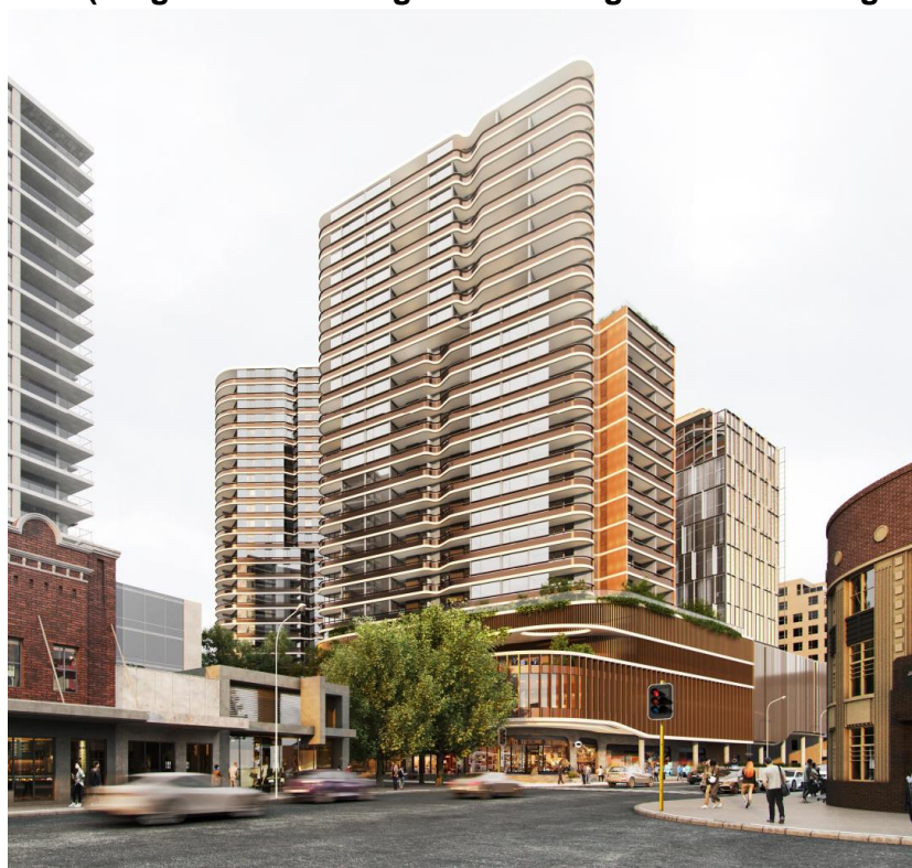
Figure 3 – View towards corner south-western corner of Hunter and National Park Streets (Stage 1 in the foreground & Stage 2 in the background)