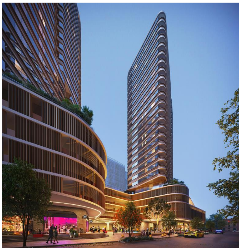
Figure 5 – Mid-block view north-easterly along western side of National Park Street.