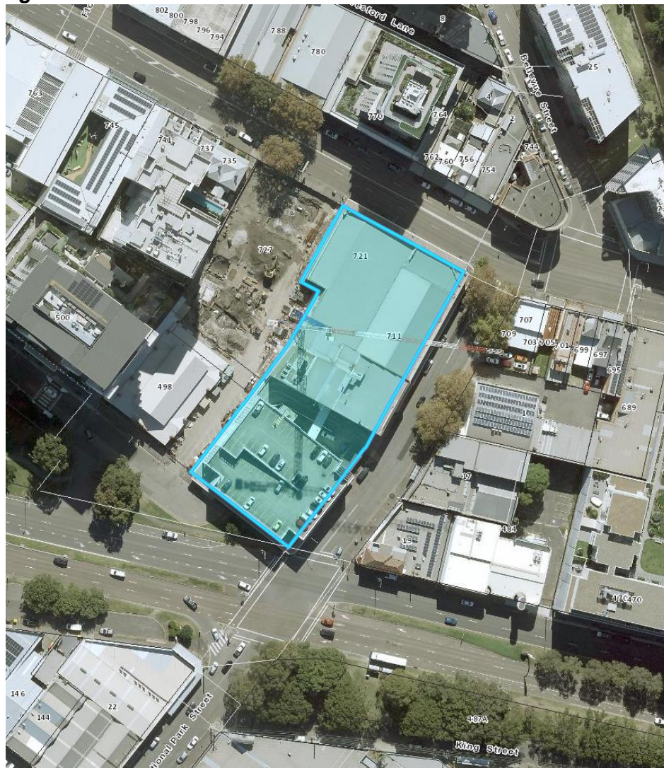
Figure 1 – Location Aerial – 711 Hunter Street, Newcastle West -Subject site highlighted in blue.