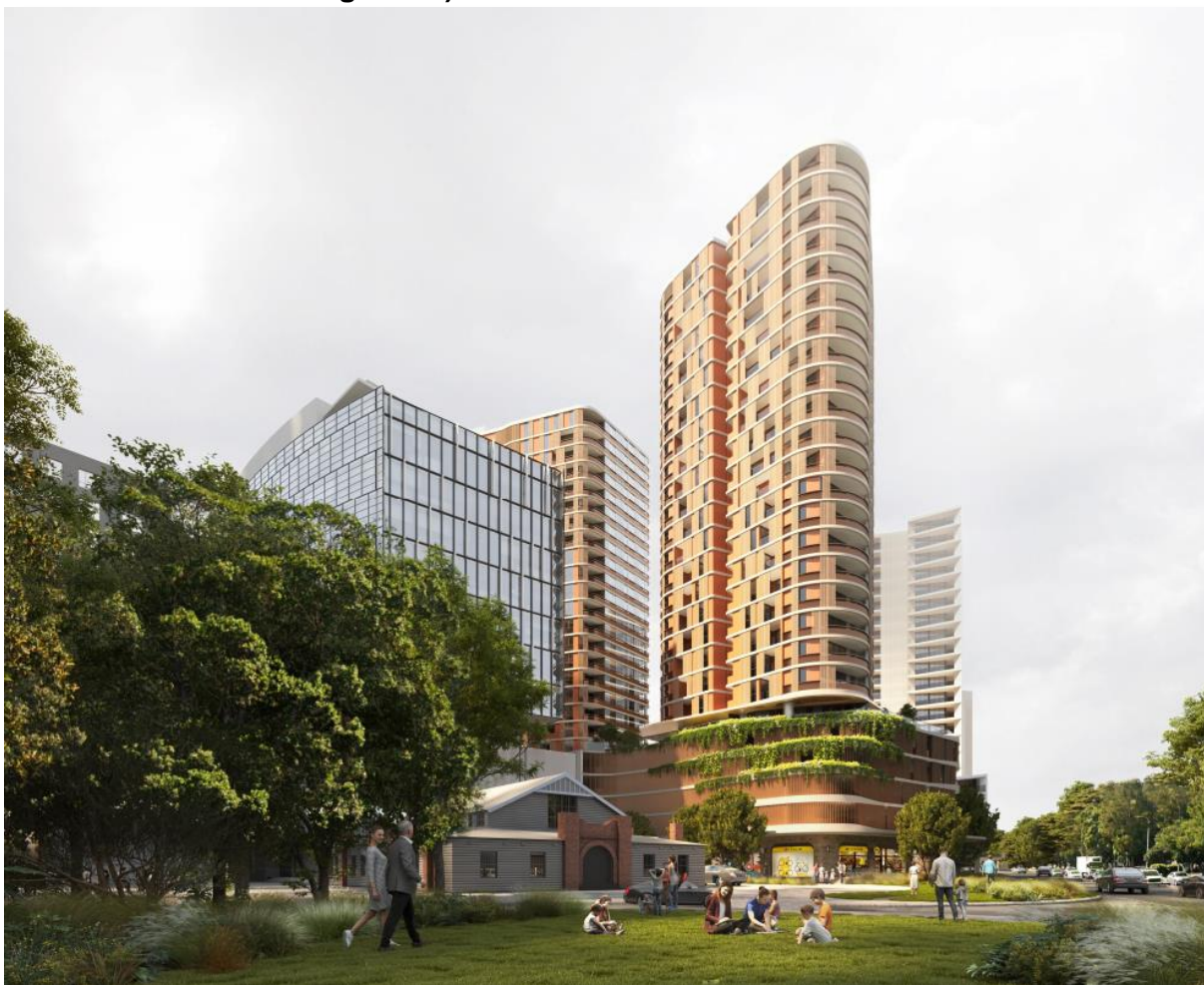
Figure 6 – View looking across Birdwood Park towards the north-western corner of King and National Park Streets. (NB: The Drill Hall heritage item to the left within the foreground)