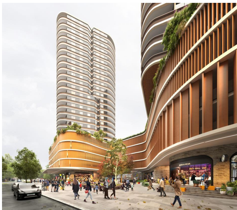
Figure 4 – Mid-block view south-westerly along western side of National Park Street.