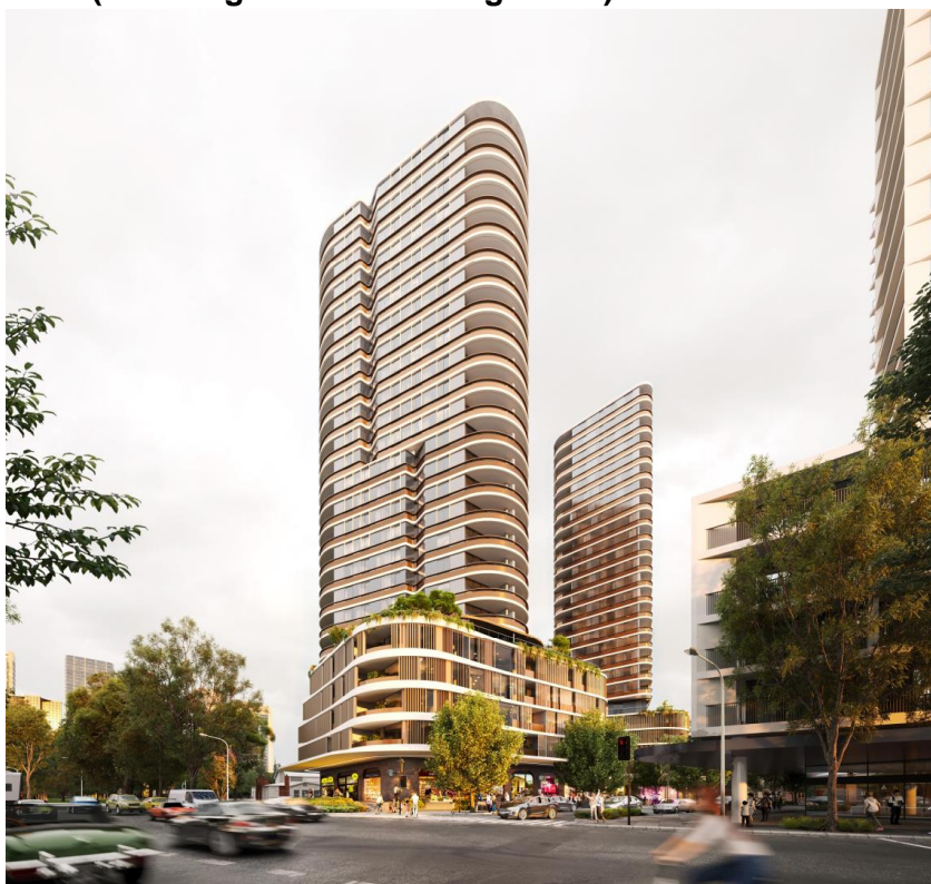
Figure 2 – View towards corner north-western corner of King and National Park Streets (NB: Stage 1 in the background)